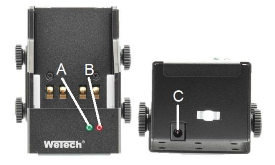
Schematic drawing WTC1704