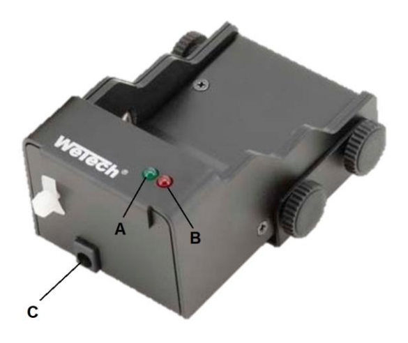
Schematic drawing WTC644